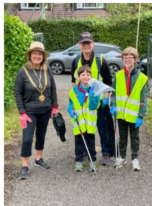
Litter picking with the Mayor

Once again, Bumbles and Buzzard Cubs supported the local food bank with the help of Bengo community 's generosity, donating food & toiletries for us to collect.